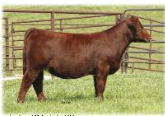
daughter of CF Cumberland 183