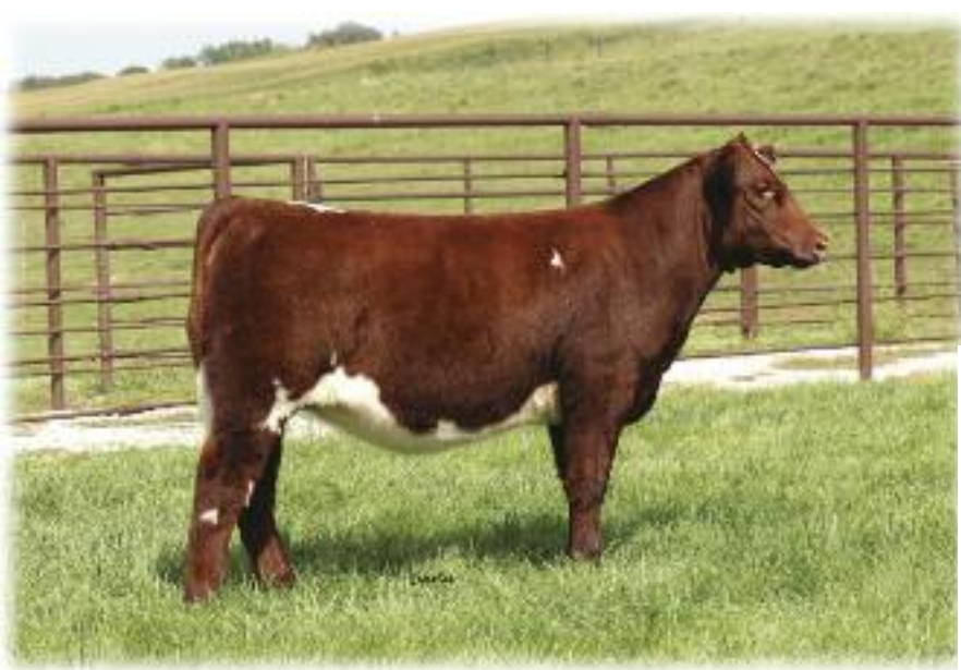
Full sister to 10b. A Maternal Legends Sale Feature

Proven champion genetics here from a big-time cow. SULL Bo's Traveling 2268 was a NWSS Junior Show Champion and 3rd Overall at the National Junior Heifer Show. These embryos are sired by the three-time National Champion, SULL Red Knight. Last year's Grand Champion Female at NAILE in the Junior & Open Show was a SULL Red Knight X Mytle Bo. Consigned by Sullivan Farms