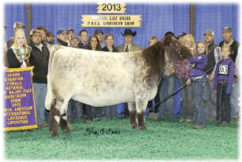
SULL Cystal's Tootie daughter of 434P

SULL Crystal's Lucy - National Champion daughter of 434P