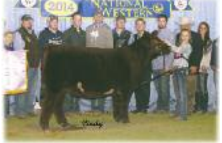
SULL Roses Are Red, many time champion that is a daughter of SULL Red Rosemary

2015 NJHS Champion Heifer - Aviator daughter.