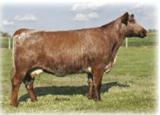
Waukaru Primabella 807 - grandam