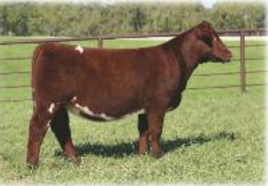
Full sister to lot 4 - A Maternal Legends Sale Feature