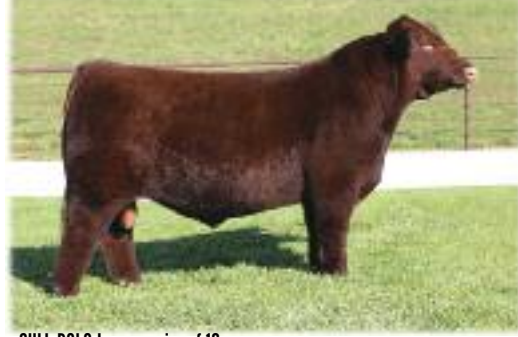
SULL RGLC Legacy - sire of 10a.