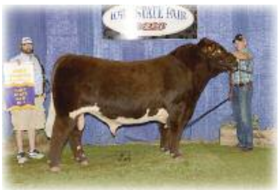
SULL Maxed Blood - full sib to embryos