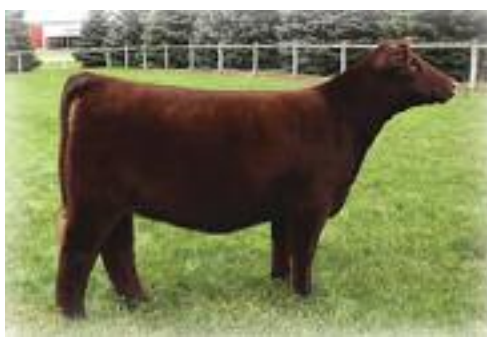
SULL Miss American- A Rosemary 636 daughter, check her out in the Stalls at Sullivan Farms