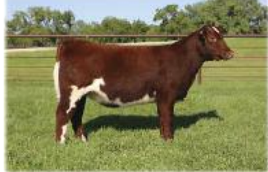
Full sister to 10b. A Maternal Legends Sale Feature