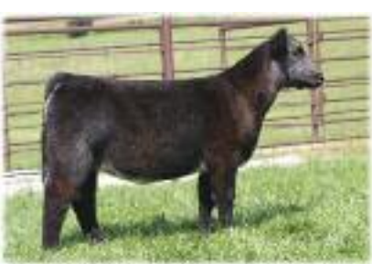
SULL Breathless - A Maternal Legends Feature and full sib to these embryos.