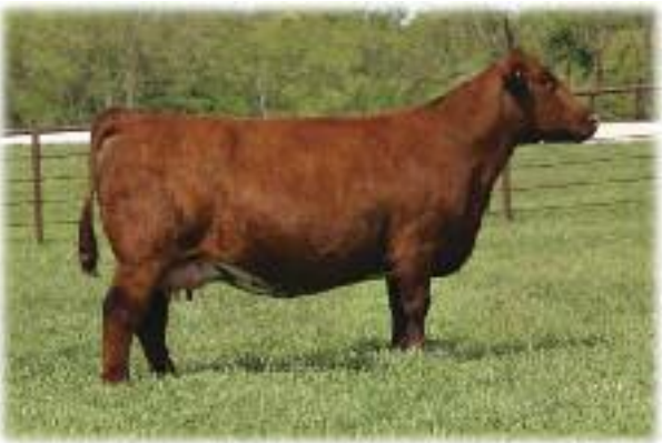
MCV Margie Million 503Q - dam