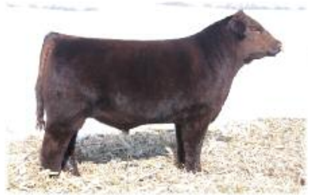
SULL Red Reward - full brother to lot 1