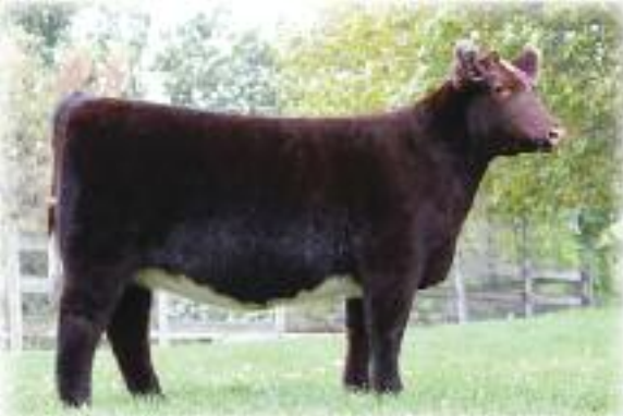
O'Cherri 307 - dam