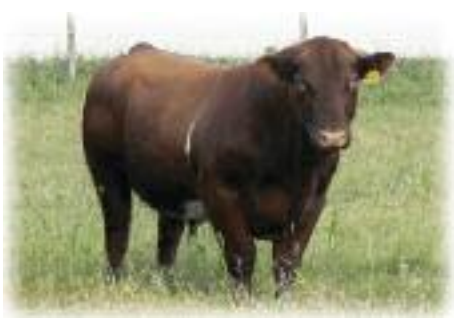
CYT Maxim 9202